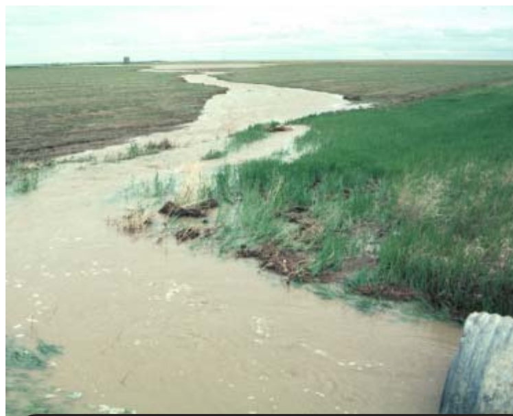
Sediments, nutrients and pesticides may be washed from agricultural land to surface runoff water