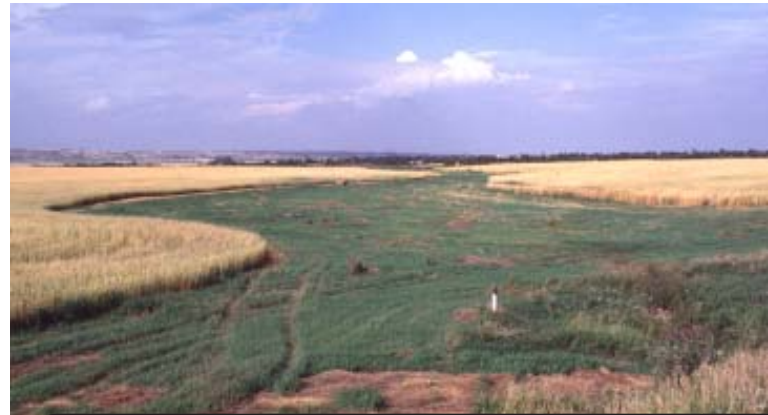
Grassed waterways act as buffers to trap sediment and nutrients

Where buffer zones surround a stream or lake, they are usually referred to as riparian buffers . These strips capture sediment and nutrients from water that is