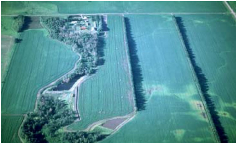
Farm practices that prevent erosion will help to protect surface water quality