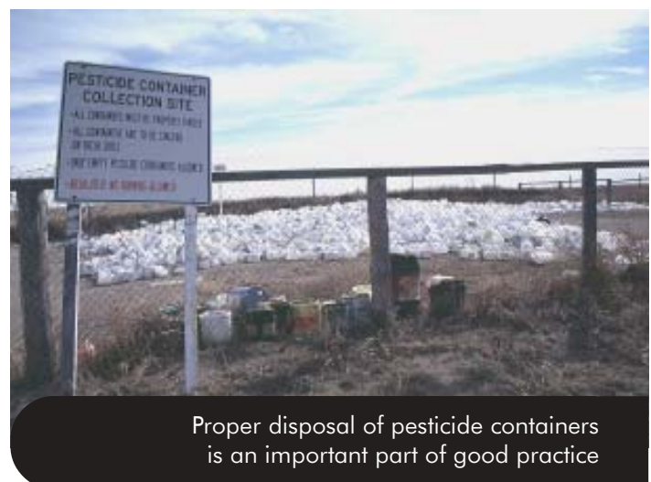
Proper disposal of pesticide containers is an important part of good practice

The use of herbicides and insecticides can be minimized through 'Integrated Pest Management'.